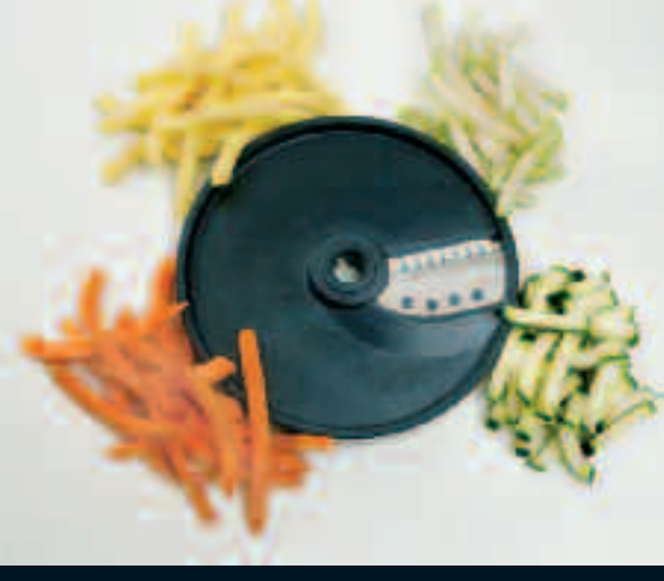
French fries (BT)