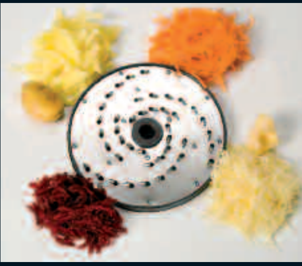
Shredding disc (RS)