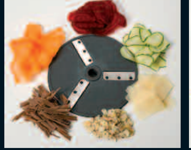
Shaving cut (HS)