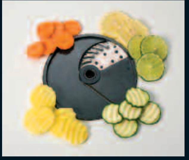
Wave cut (SU)