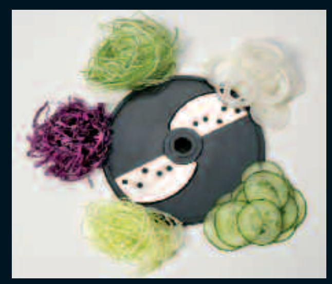
Fine cut (F)