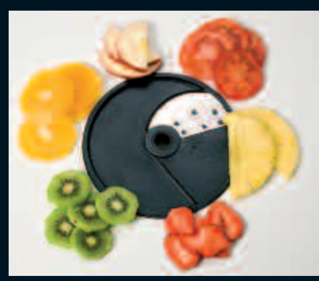
Tomato slicer (TO)