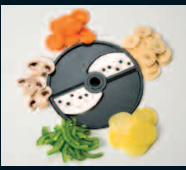
Coarse cut (G)